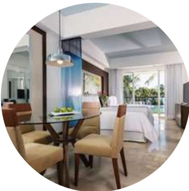
Junior Suite Pool View