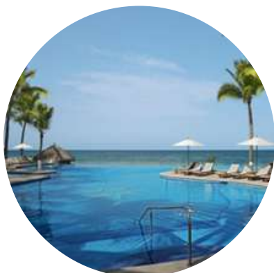
Infinity (Adults Only)