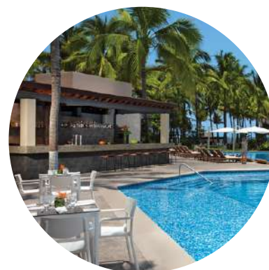
Snack Bar Surfós