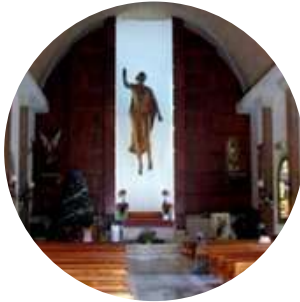
San Rafael Pitillal – 45 min. Tel. 322 222 24 40