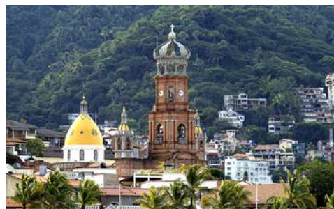
Ntra. Sra. De Gpe | Puerto Vallarta Downtown - 50 min | Tel. 322 222 13 26