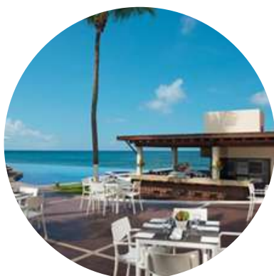
Snack Bar Oasis