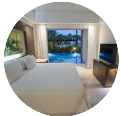
Altitude Club Junior Suite Swim-Out