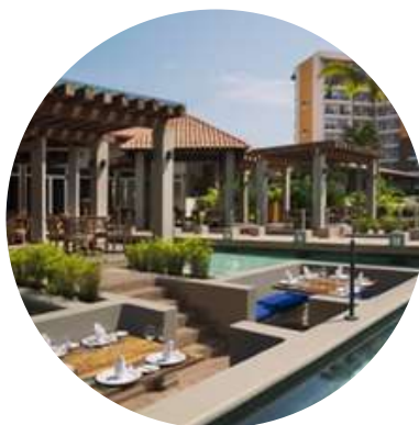
The Grill Restaurant