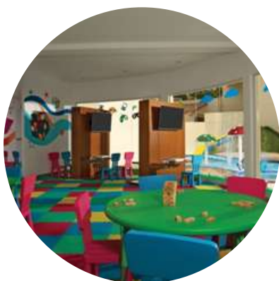
Kamp Krystal Kids Club (Kids from 4-12 years)