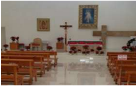
Viva Valle Dorado Valle Dorado – 15 min.