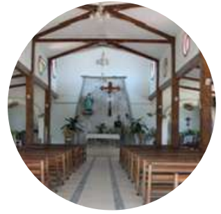
Nuestra Sra. de la Paz Bucerías – 15 min. Tel. 322 728 16 55