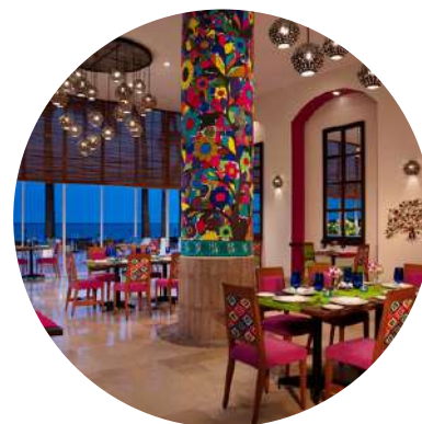
Hacienda El Motero Restaurant