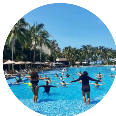
Daytime Activities & Themed nights