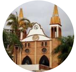
Ntra. Sra. Del Refugio Puerto Vallarta Downtown – 45 min. Tel. 322 222 49 80