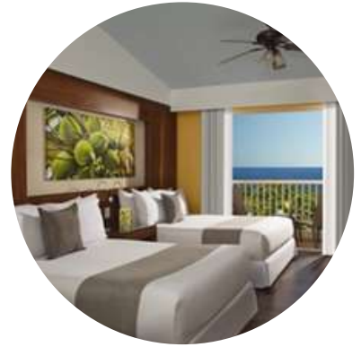
Deluxe Ocean View