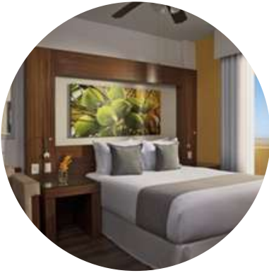
Standard Resort View