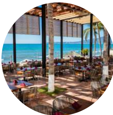
Buffet "O" Restaurant