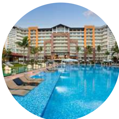
Unique (Family Pool)