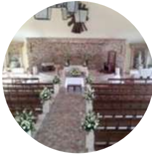
María Reina de La Paz Marina Vallarta – 25 min. Tel. 322 209 15 45