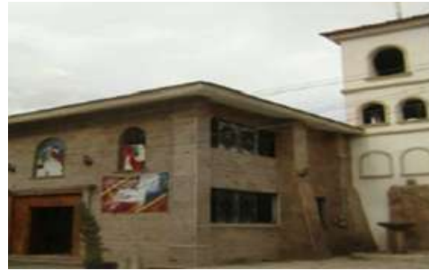
Sagrada Familia Jarretaderas – 20 min. Tel. 322 297 05 14