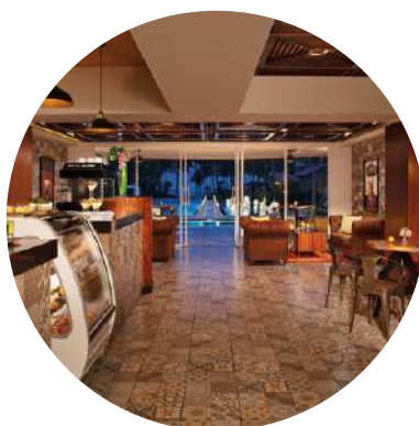
Coffee Shop Take a Bite