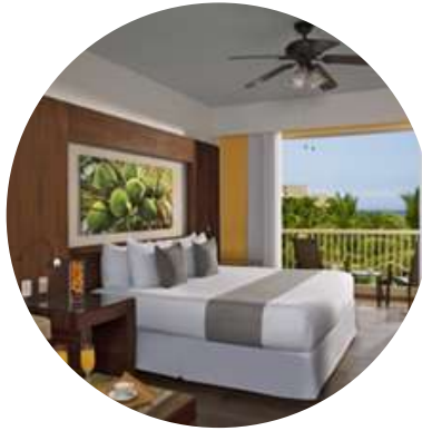
Deluxe Tropical View