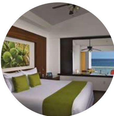
Junior Suite Ocean Front