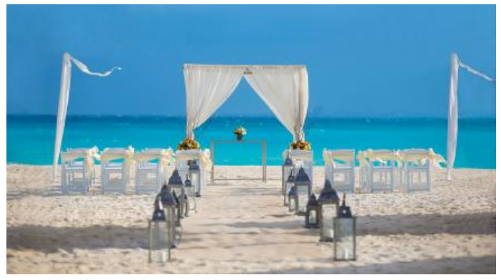
2026 SELLING PRICE $1,100.00 USD Additional guest: $20 usd

This package is complimentary when booking a minimum of 7 nights (All Inclusive Package) in Altitude Suite Ocean Front, Corner Suite Ocean Front, Honeymoon suite or higher, or if 5 rooms are reserved for a minimum of 3 nights at any room category.